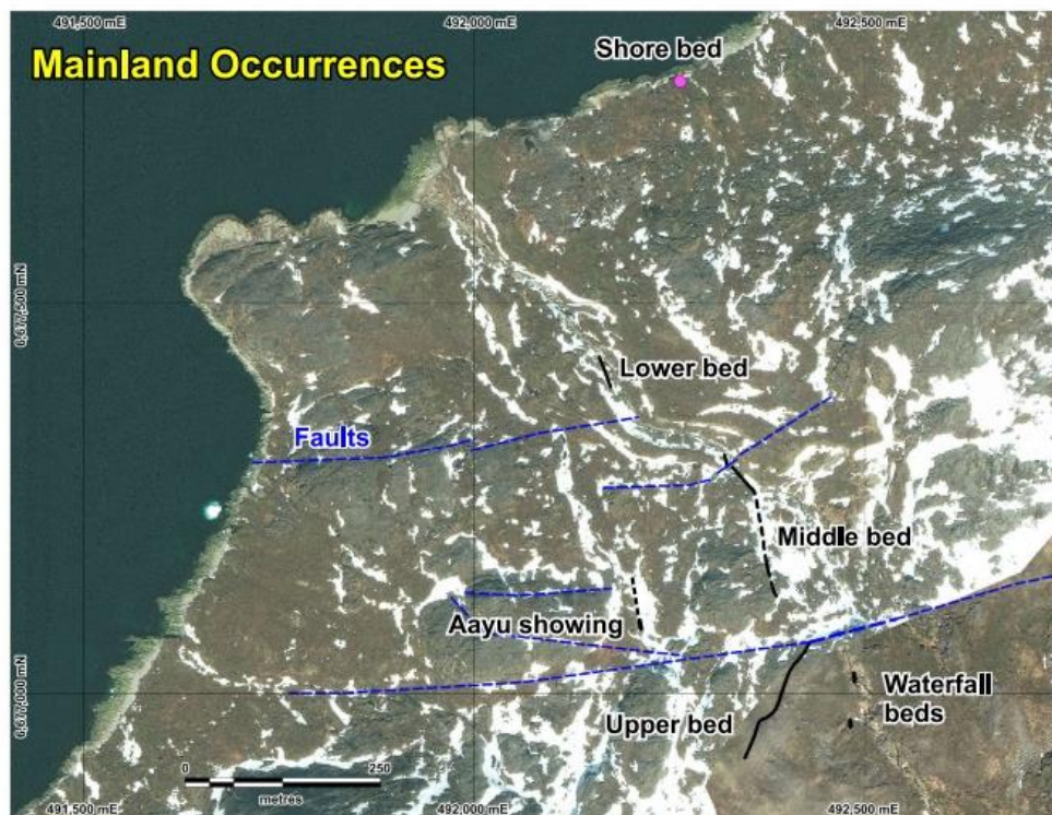
Image 2: location of newly discovered graphite beds ("PA Showing") on mainland portion of the Company's licence area

The results of this assaying, and the further ground EM data collected in the field, will enable the Company over the next 1-2 months to verify the principal graphite targets for drilling and to design a maiden drilling campaign.